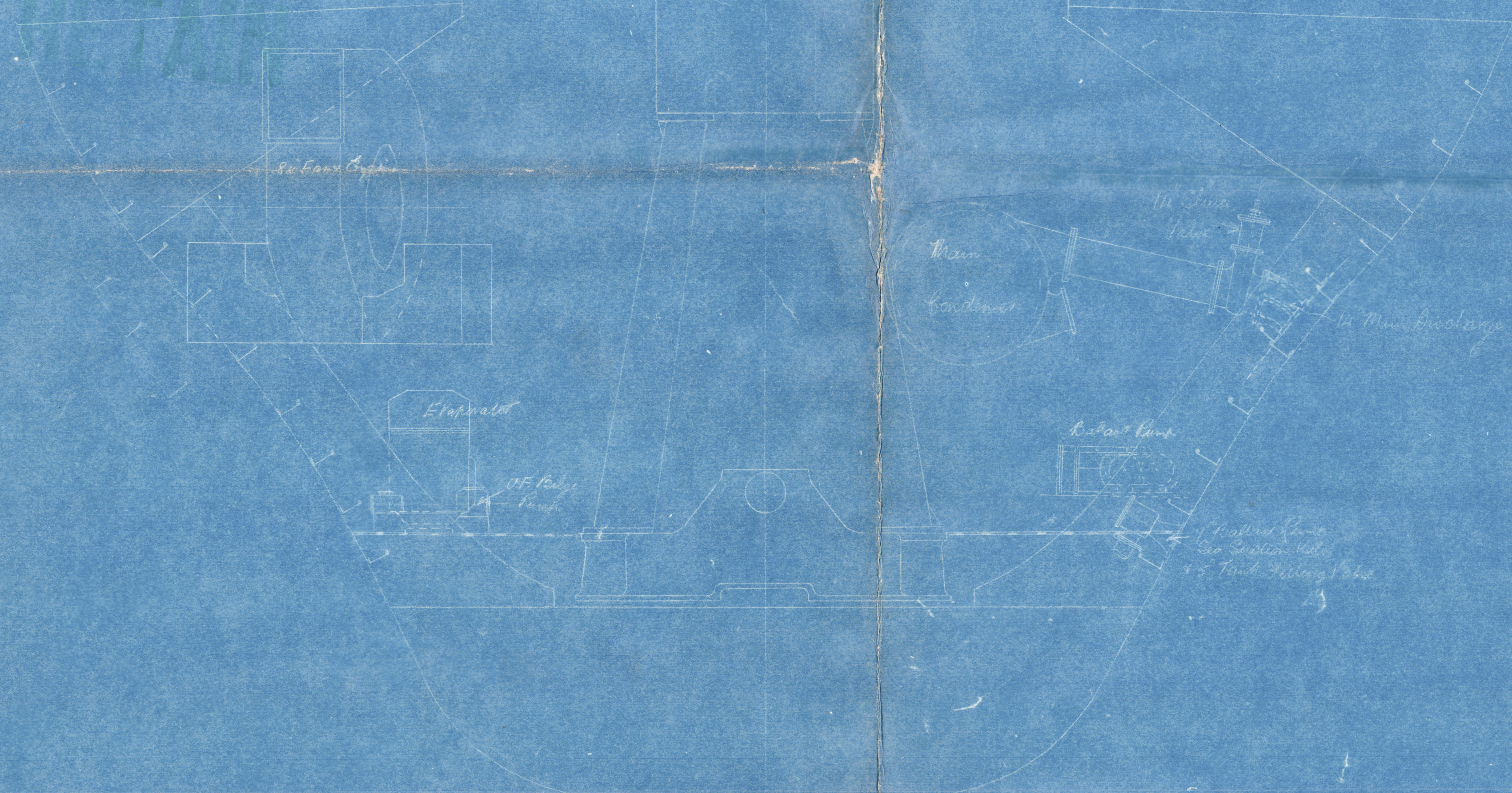
Section at 24 Transverse Sectioning App.

OILERS "NASSA" & "NOBIA" Proposed Arrangement of Machinery Scale 3/8" = 1 foot