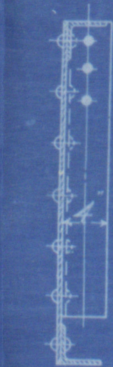
SECTION ON A-A SHOWING TOP FLANGE

NOTES:- ALL RIVETS 3/8" DIA. RIVETS THIS SIDE CSK. NEAR SIDE. ALL OPEN HOLES SHOWN THIS SIDE 1/8" DIA. FOR 3/8" DIA. RIVETS. FRAME MARKS TO BE MARKED ON GIRDERS AS SHOWN. FORE & AFT TO BE MARKED ON ENDS OF GIRDERS AS SHOWN. QUANTITIES GIVEN ARE FOR 1 SHIP ONLY. FAIRING LINES TO BE MARKED ON GIRDERS WHERE SHOWN.