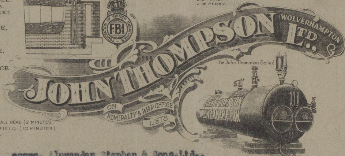
The John Thompson Boiler