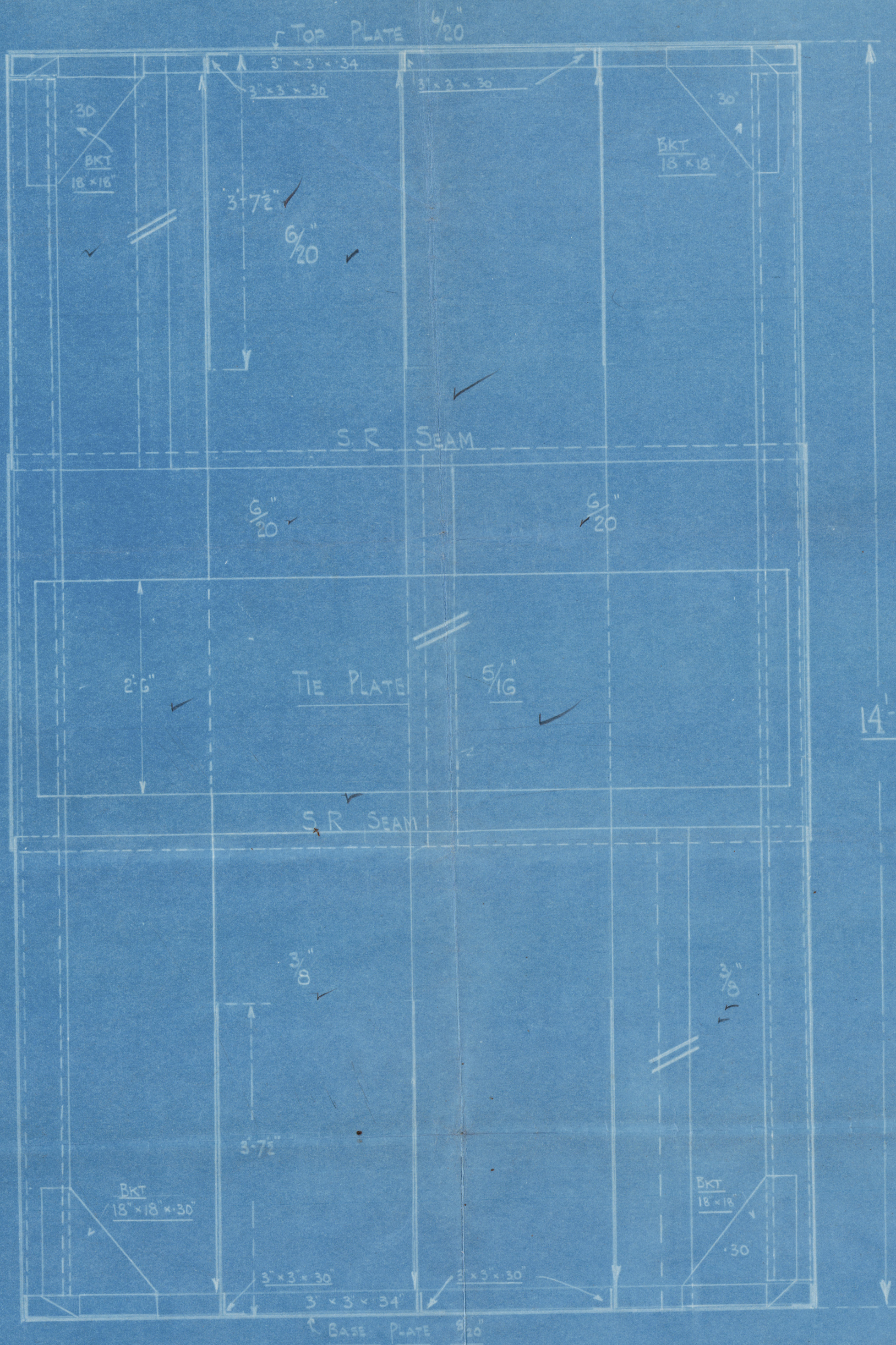
ELEVATION THRO A-B