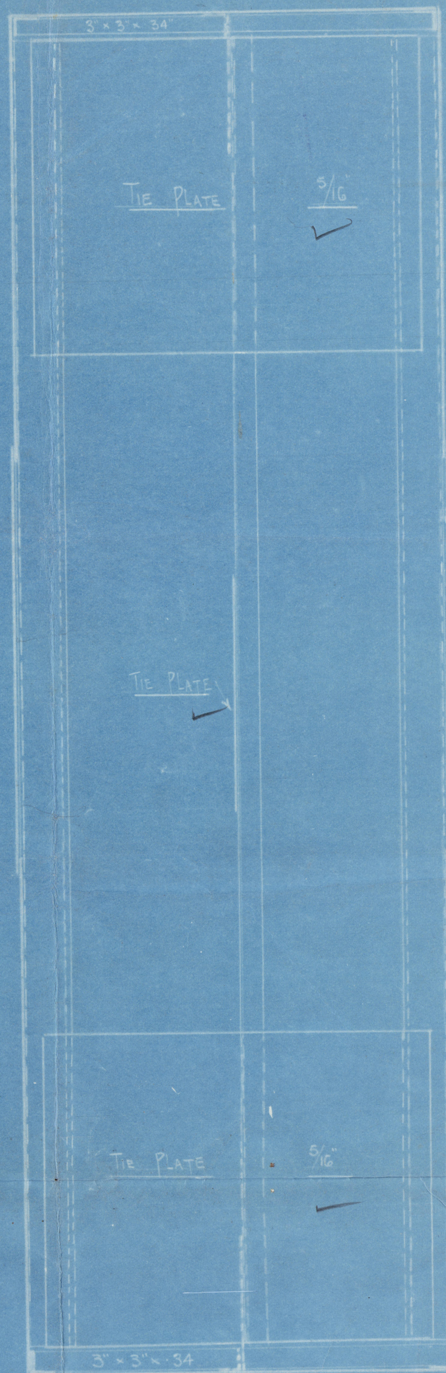
SECTION THRO C-D

APPROVED LLOYD'S REGISTER SHIPPING MANAGEMENTS per [Signature] 11.6.20