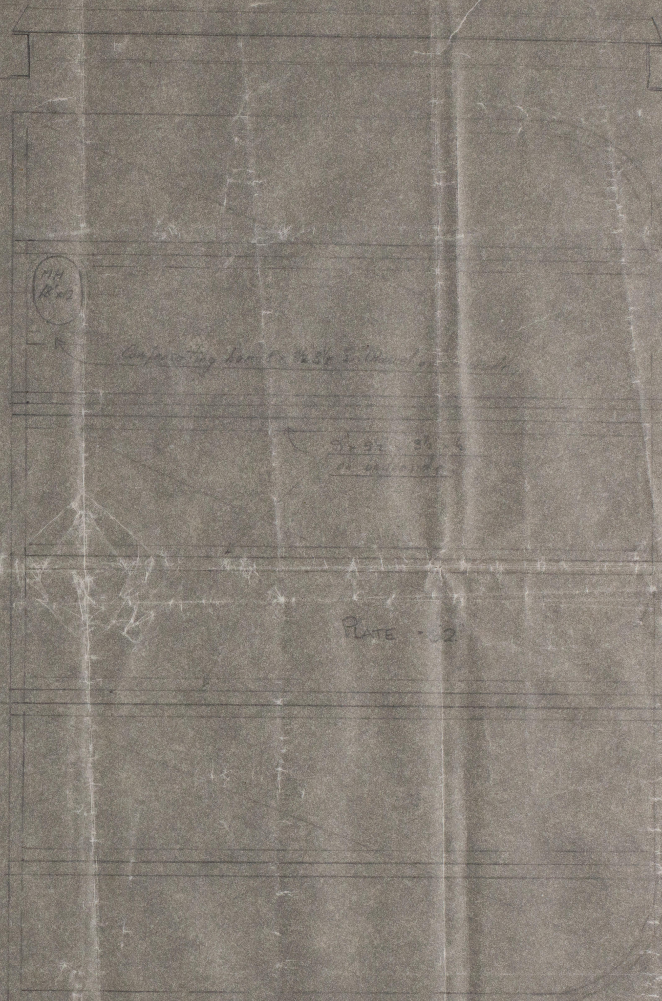
PLATE - 62