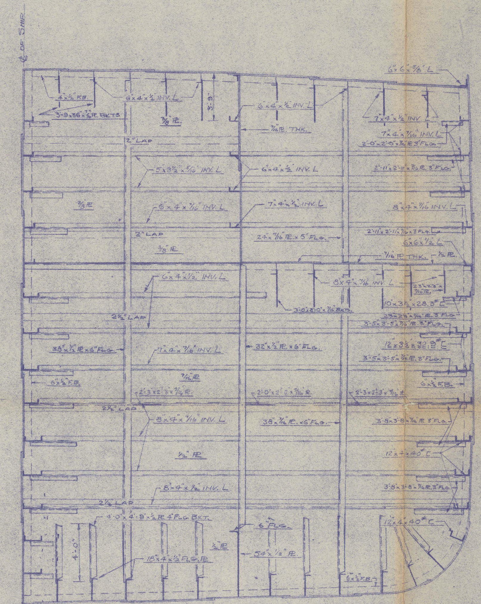
OIL TIGHT BULKHEAD No 52 LOOKING FORWARD