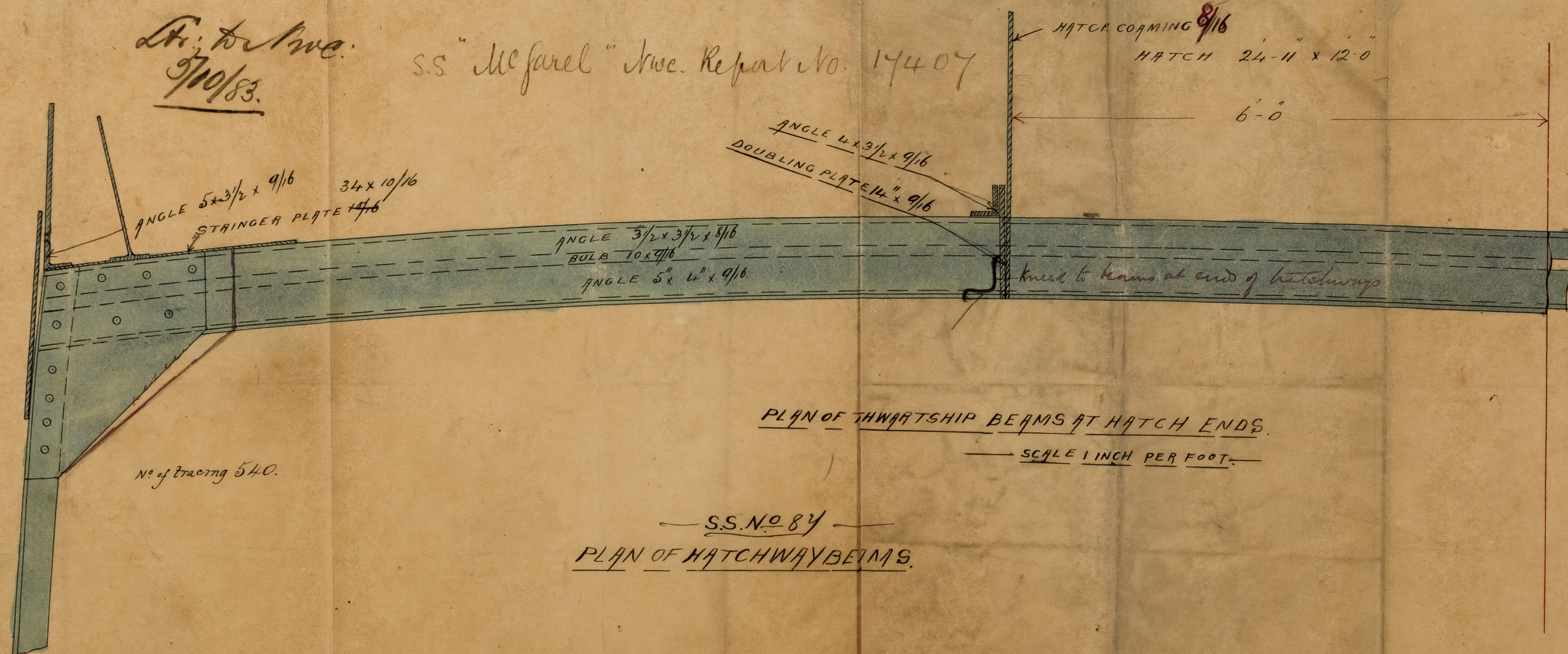
PLAN OF THWARTSHIP BEAMS AT HATCH ENDS.