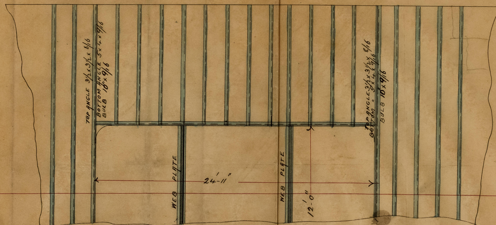
PLAN OF FORE AND AFTER HATCHES