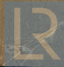
Plate from Consett

Doubled at Wedging. Butts double riveted & straps 1/16 thicker than plates they connect.