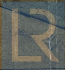
Plate 3 1/2 x 3 1/2