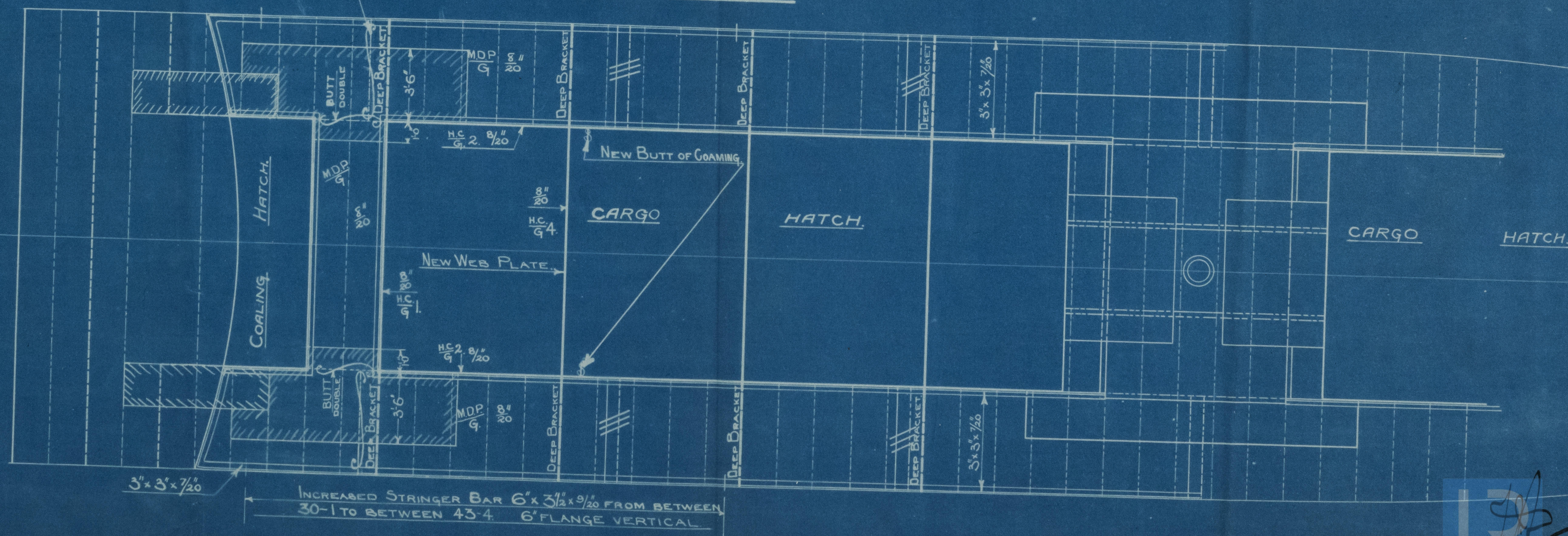
— PLAN OF MAIN DECK. —

DOUBLE RIVETED BUTTSTRAPS \frac{2}{20} THICKER THAN THE PLATES THEY CONNECT