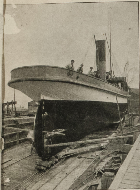
Slipway: Steam-driven 105 cradle, 250 tons lifting power.

Iron & Steel Shipbuilders & Repairers, Tug & Barge Builders, &c.