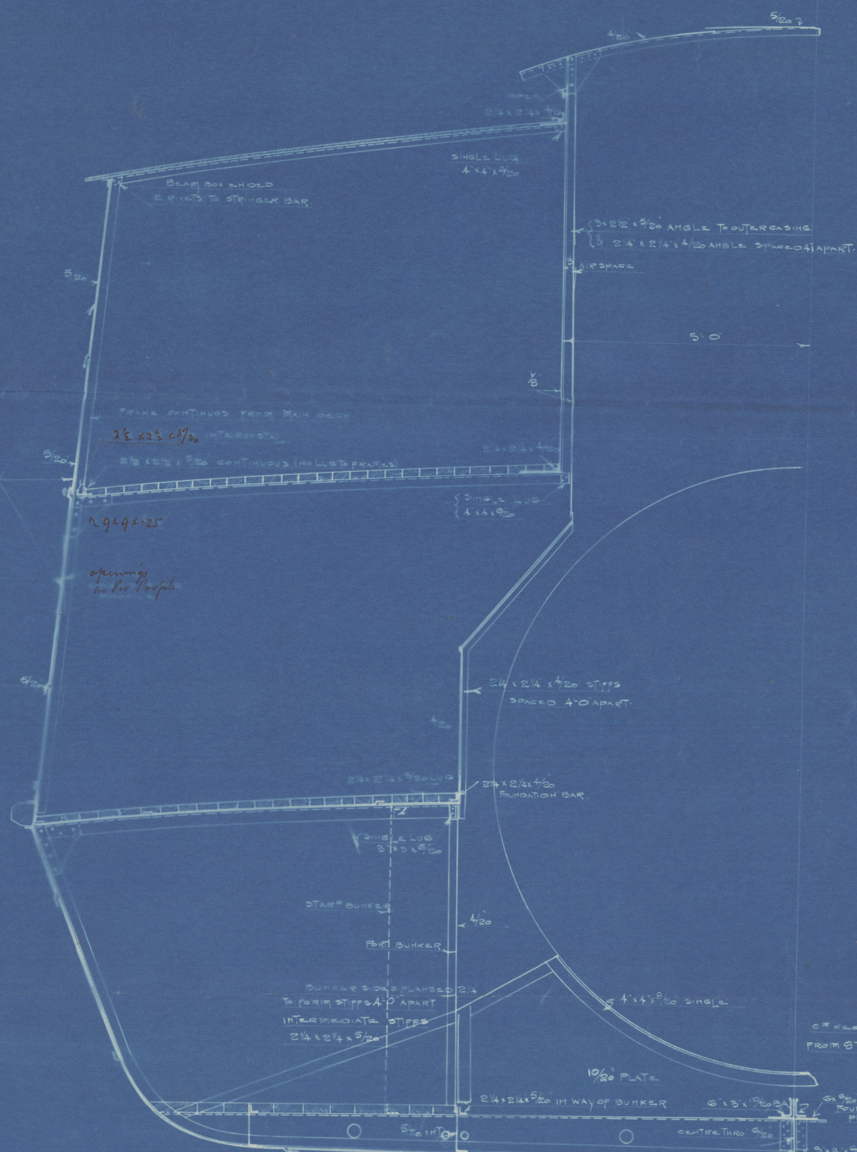
SECTION THRO' BOILER ROOM.