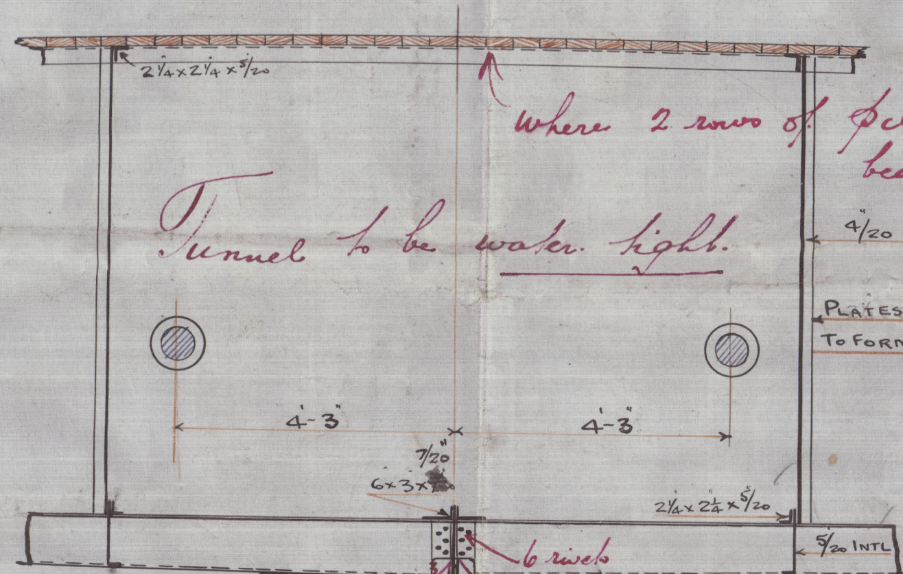
SECTION THRO' TUNNEL

EQUIPMENT. 2 BOWER ANCHORS 10 1/2 CWTs STOCKLESS. 1 STREAM ANCHOR 3 1/2 CWTs EX. STOCK. 1 K. ANCHOR 1 1/2 CWTs EX. STOCK. 135 FMS 1" STUD. CHAIN CABLE. 60 FMS 2 3/4" STEEL WIRE (STREAM). 75 FMS 2 1/2" STEEL WIRE (TOWLINE). 90 FMS 2 1/4" STEEL WIRE (HAWSER).