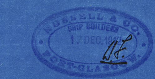
For details see copy of approved plan