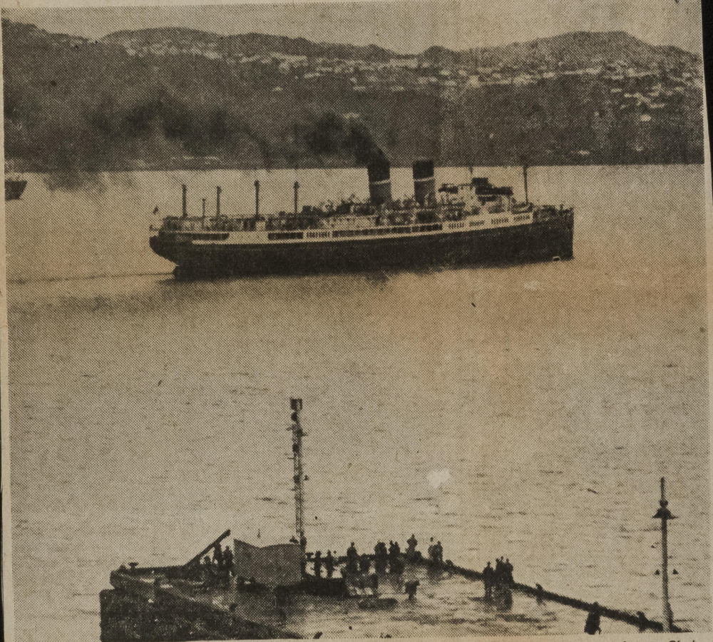
THE MONOWAI BEGINNING HER LAST VOYAGE to the shipbreakers in Hong Kong from Clyde Quay Wharf, Wellington, yesterday afternoon. She was given a send off by a crowd of about 50 on the wharf. Others watched the Monowai leave from vantage points in the city.