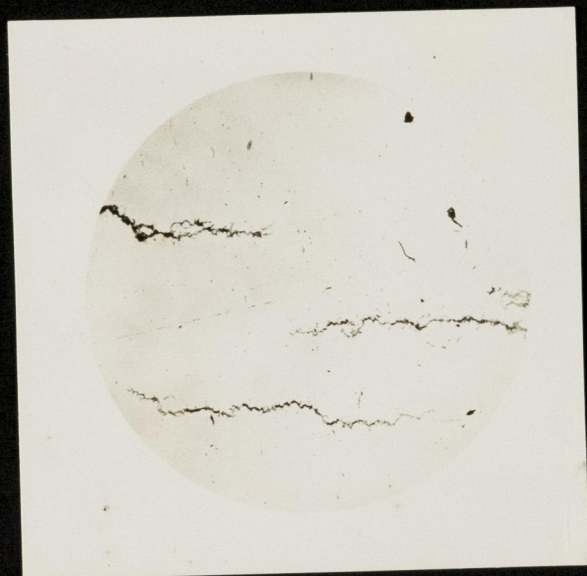
N o 600. (etched) X 100.