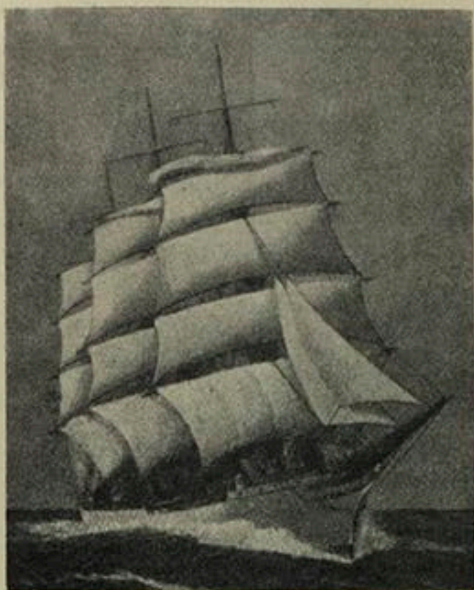
4-m sk „HERZOGIN CECILIE“

Telegramadress: "GUSTAFERIKSON" Mariehamn