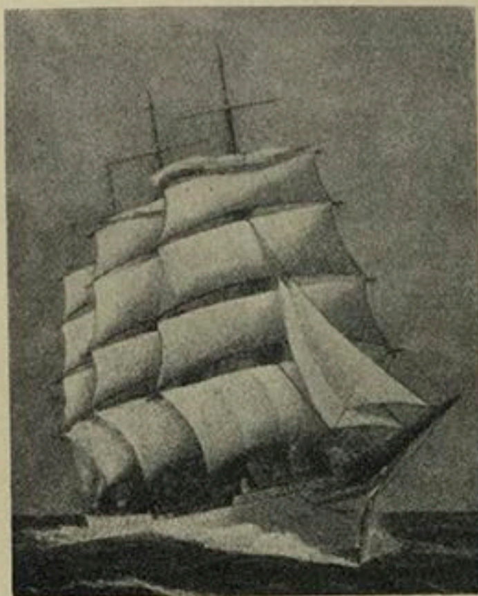
4-m sk. „HERZOGIN CECILIE“

The Secretary, Lloyd's Register of Shipping, 71, Fenchurch Street, London E.C.3.